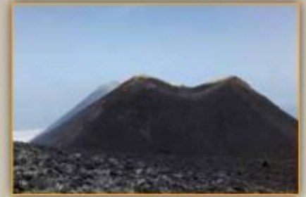
Etna Summit Craters 3300 m.