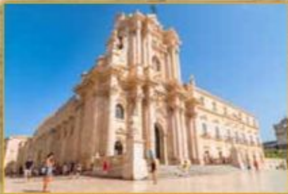
Siracusa and Noto Full-Day