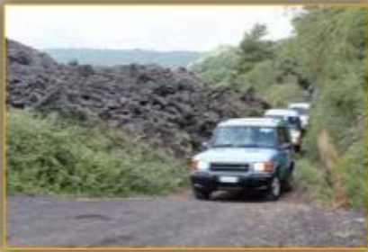
Etna Off-road Half-Day/Full-Day