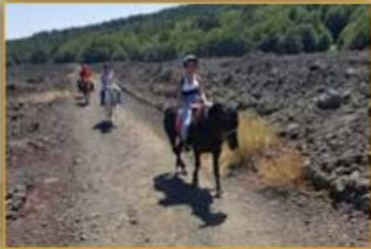
Etna Horse Riding