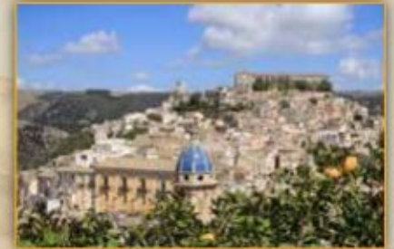
Modica and Ragusa Full-Day