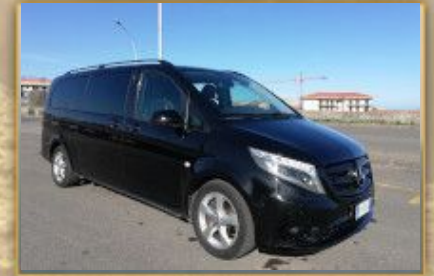
Transfer e Tour