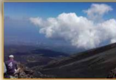
Etna Crateri 3000 m.