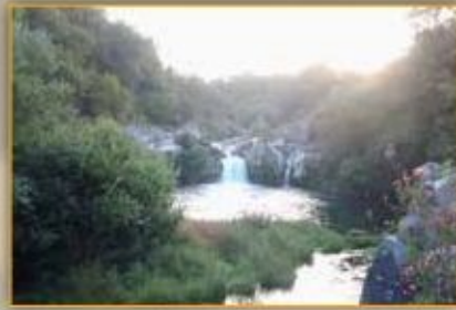
Etna / Gole Alcantara Off-road Full-Day