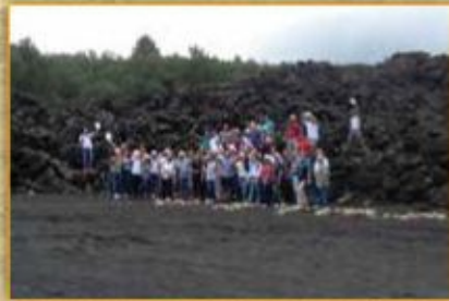
Incentive and Team-Building